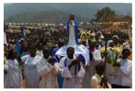
Our Lady of Kibeho

But would it really bear fruit? After only a year and a few Months, hell would be unleashed on Rwanda, a Genocide of Unimaginable Proportions, with frightening Massacres causing Hundreds of Thousands of Deaths, as the Virgin Mary announced during her appearance in Kibeho, a Small Town in Rwanda.