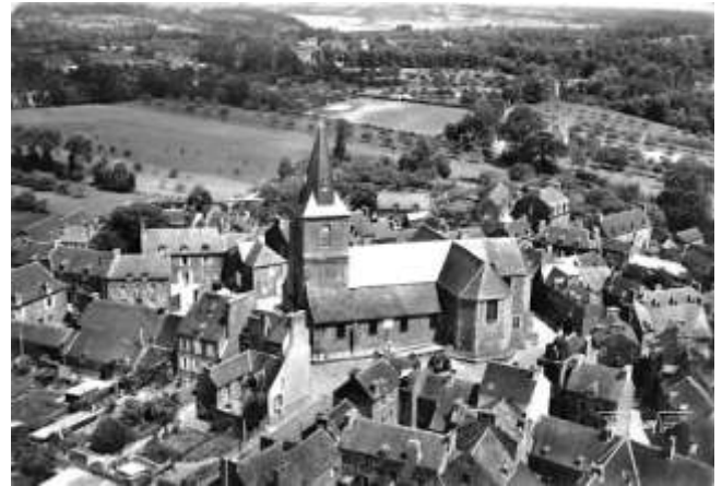
Plouer on Rance