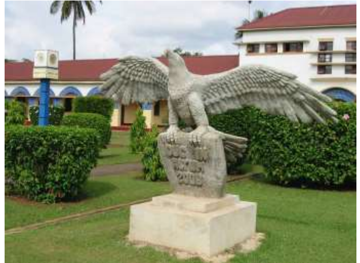
Monument "Duke in Altum" at St Mary's Kisubi