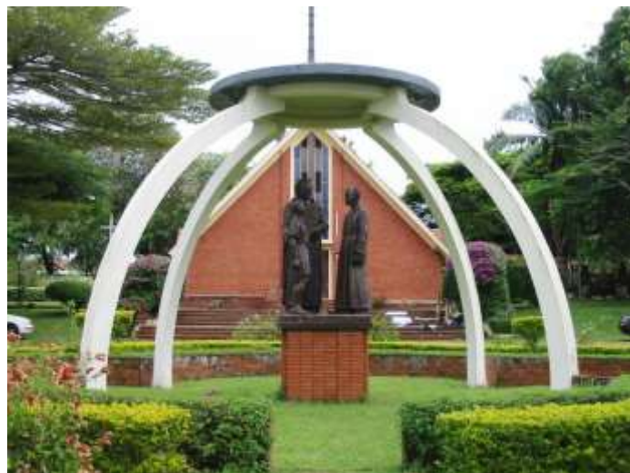
Monument of the Founders at Mount Saint Teresa, Kisubi