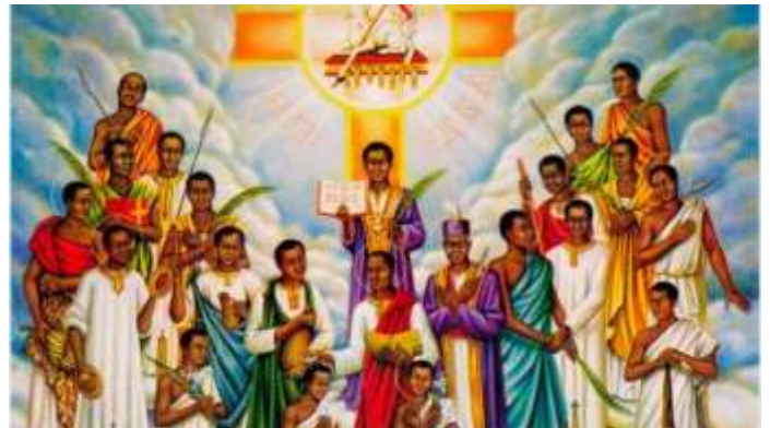
Martyrs of Uganda

Faith. In a few years the Gospel had spread rapidly. Christianity had deeply touched the Hearts of the People, particularly young people attracted by the person and message of Jesus. To stop Christian Conversions, Kings and Religious Authorities of the place began to harshly persecute the