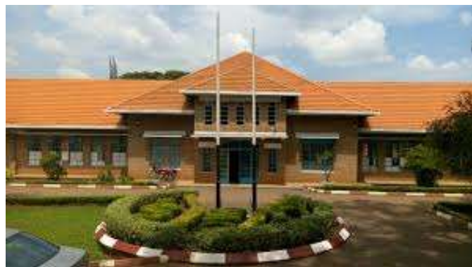
St Henry's College - Kitovu

them simply by the Constant Progression of their Success.