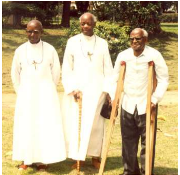
The 3 Pioneer Brothers, during their 60 years of Religious Life