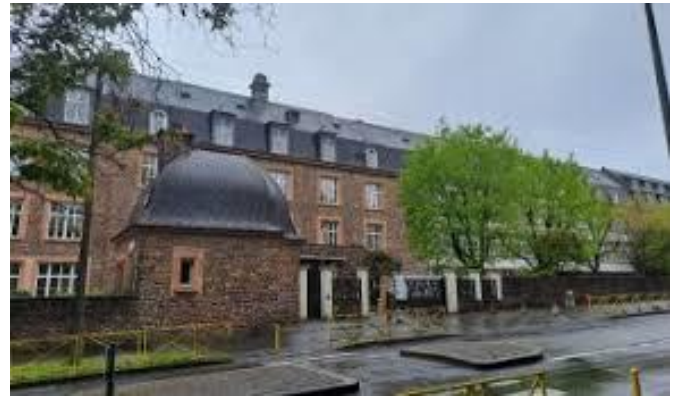
The Assumption in Rennes, Today